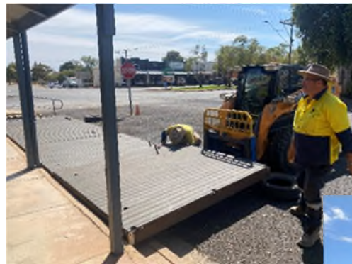
Employees of the two Councils installing the platforms