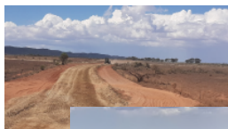
Resheeting works on Warcowie Road in early February.

Meanwhile the Director of Works and crew are ensuring both main towns are continuing to receive appropriate workforces and attention to maintain the standards.