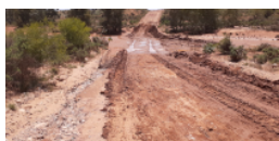
Most of the flood damage from the January rains has now been repaired.