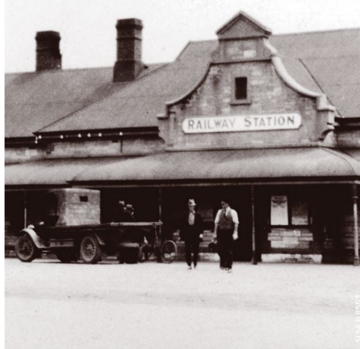
2 Quorn Railway Station, 1932