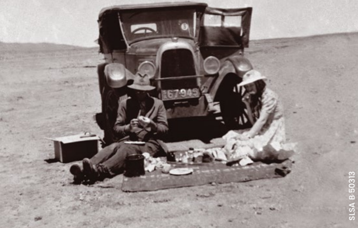
6 A picnic lunch near Gordon