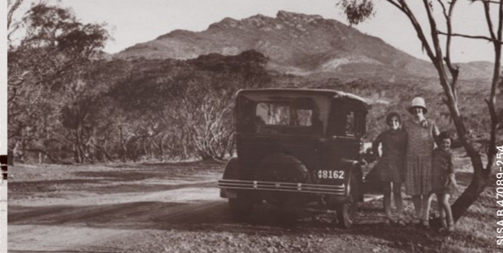
14 Devil's Peak