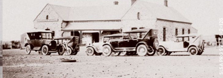
12 Saturday afternoon at Cradock Hotel, approximately 1930