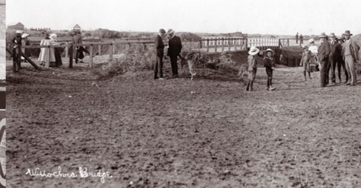
13 The opening of Willochra foot bridge, from a post card dated 1939