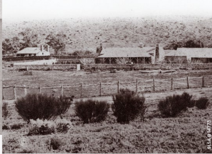
8 Kanyaka Station, approximately 1862