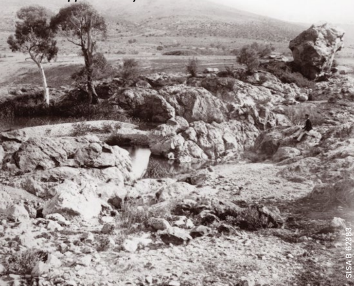
7 Death Rock and Kanyaka Waterhole, approximately 1885