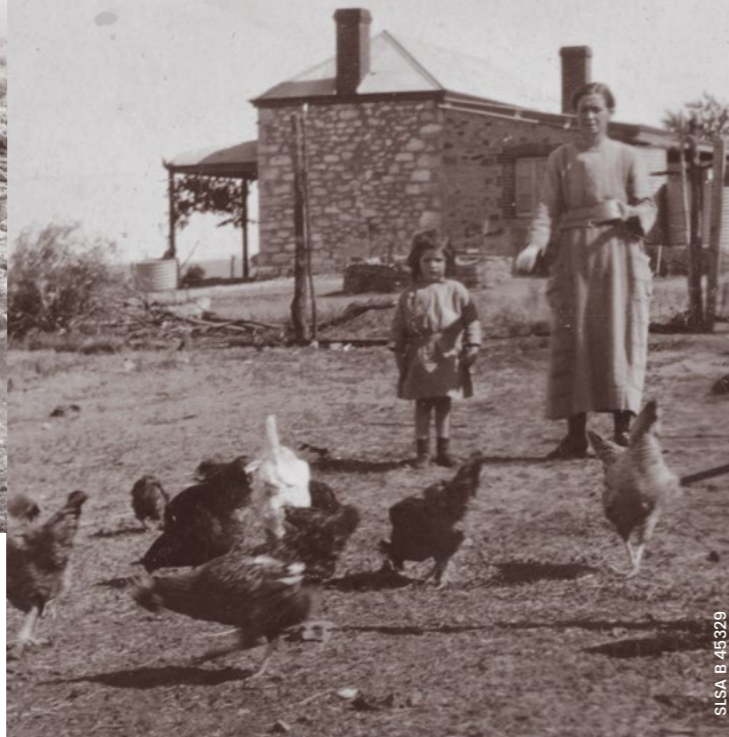
9 Farm life at Wilson, approximately 1900