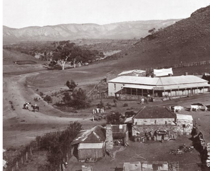
1 Saltia, approximately 1876